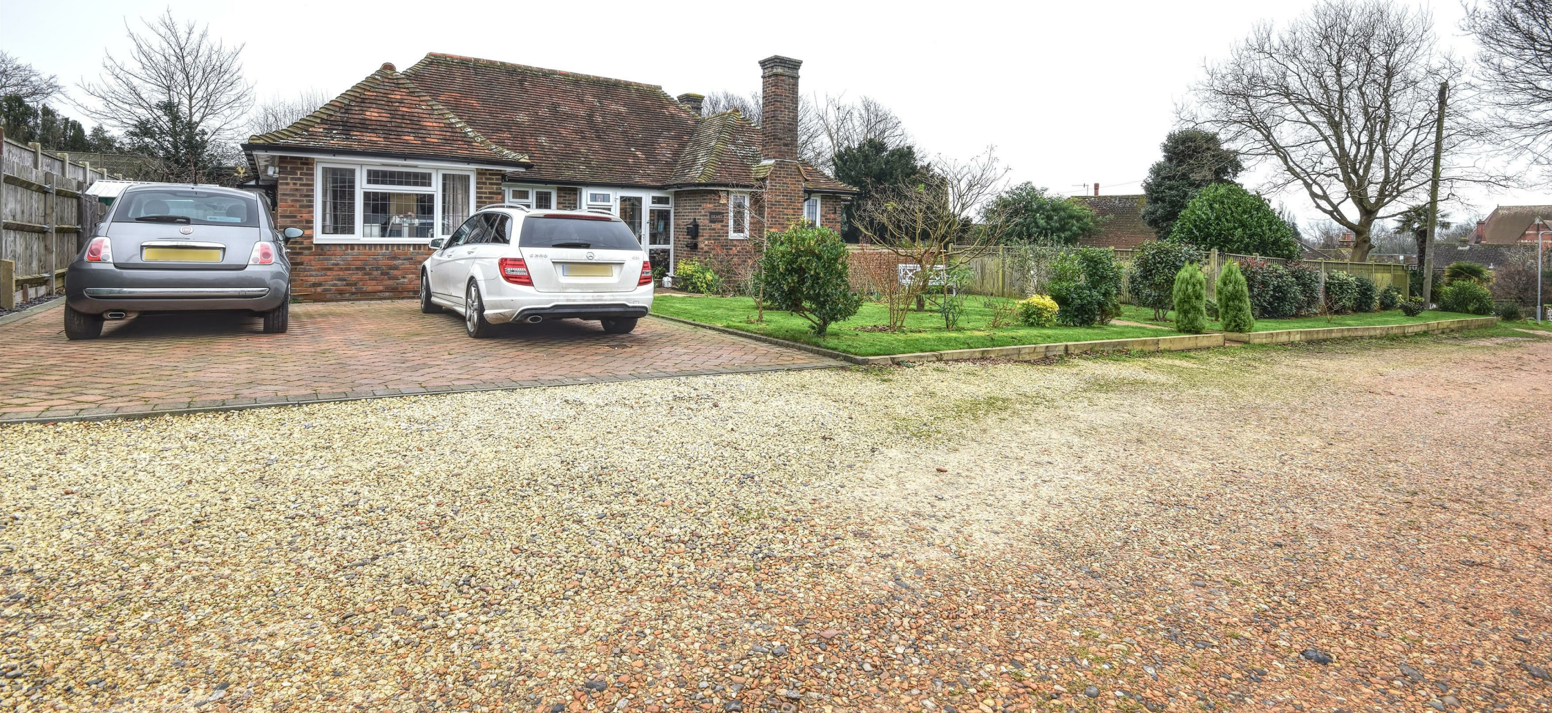
Deans Park Lane, Bexhill-On-Sea, East Sussex TN39 4DS £675,000